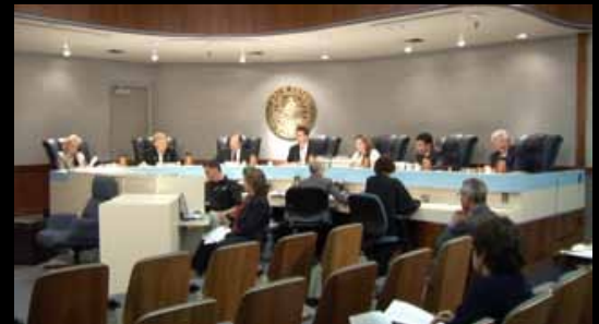
Live city council meeting