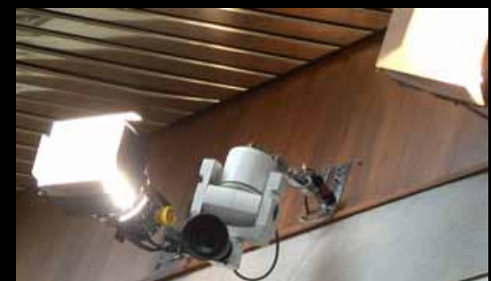
Robotics cameras feeding FORK