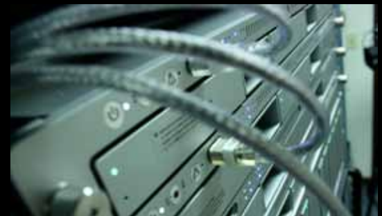
FORK's video sources