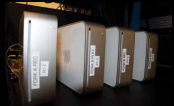
Mac Mini - FORK Playback