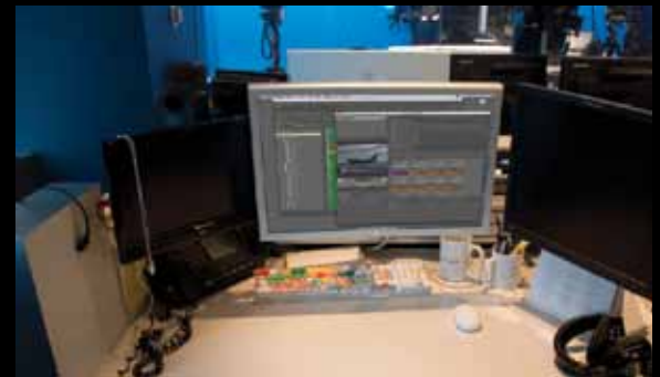
FORK and Final Cut Production Station