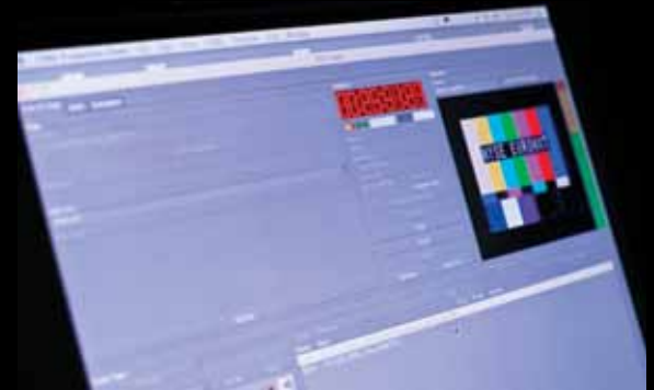
FORK Production - Ingest

"Another great feature of FORK is while I'm ingesting clips, I can mark whenever there's a mistake or a second take in raw production footage," Uchida adds. "I used to have to write down the timecode and manually enter it later while editing to get to that point in the timeline. Now I just mark it once in FORK and the marker shows up automatically in Final Cut Pro when I start editing."