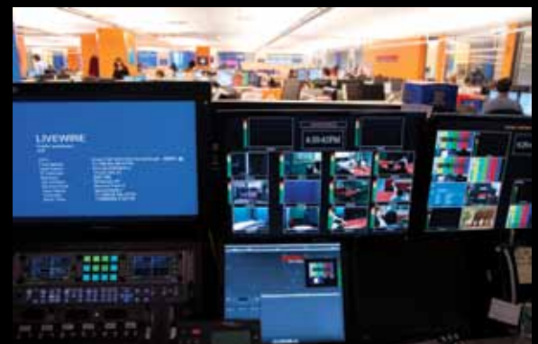
Thomson Reuters "Insiders" control-room desk in NYC From one desk, operators can do the following using FORK Production: Ingest in SD or HD, browse content across departments, edit using FORK Editor, playout using Live Assist, review packages and Publish content to the web.

Krishnaswami recalls the evolution that occurred in order to make that goal a working reality. "When I joined the staff at Reuters, they already had a Final Cut Pro editing integration that was at about 80 % of where it needed to be," he says. "You initially had people cutting and ingesting on a system where some pieces were not fully set up yet. So I wanted to tie up those loose ends and realize the original vision of a cutting edge solution."