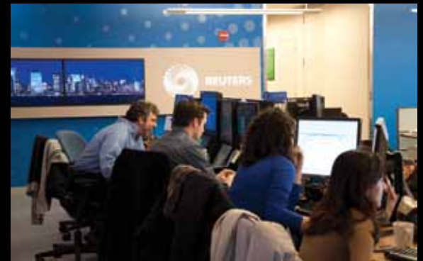
Reuters Producers running FORK