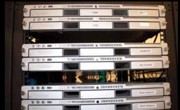
Apple XServe running FORK's video servers