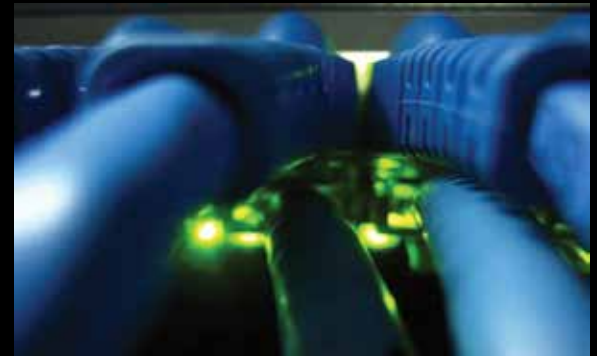
FORK - IT

Building4Media has over a decade of experience delivering IT-based broadcast automation and media asset management solutions. More than 260 broadcast networks in 37 countries rely on Building4Media's FORK software to produce and deliver their daily programming. FORK's powerful features are utilized as well outside of traditional broadcasting in realms as diverse as the military, government and medicine.