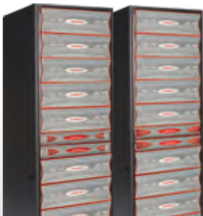
DDN S2A9700 & S2A9900 SAN Storage Systems are capable of storing up to 600 hard drives, or 600TB in a single data center rack

The xSTREAMScaler File Storage systems automate the movement of content between active, highest-performance storage and inactive, inexpensive longer-term storage. The policies that drive the automated data movement are customizable to conform to the existing workflows, accommodating many projects at the same time. Fully compatible with Final Cut Server, automated data movement in the xSTREAMScaler system dramatically lowers cost by automatically freeing up valuable disk space for new projects while retaining inactive content on lower-cost storage for delayed access. At the same time the archive is fully transparent to all applications and users, eliminating the need for training or deployment of additional software tools.